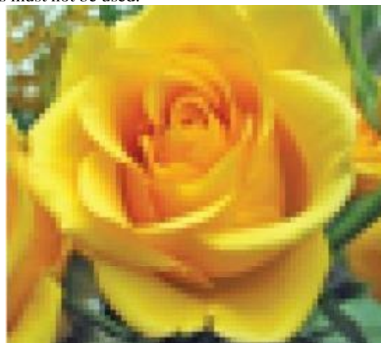
Fig. 2. Example of an unacceptable low-resolution image

Page numbers, headers and footers must not be used.