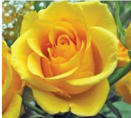
Fig. 3. Example of an image with acceptable resolution